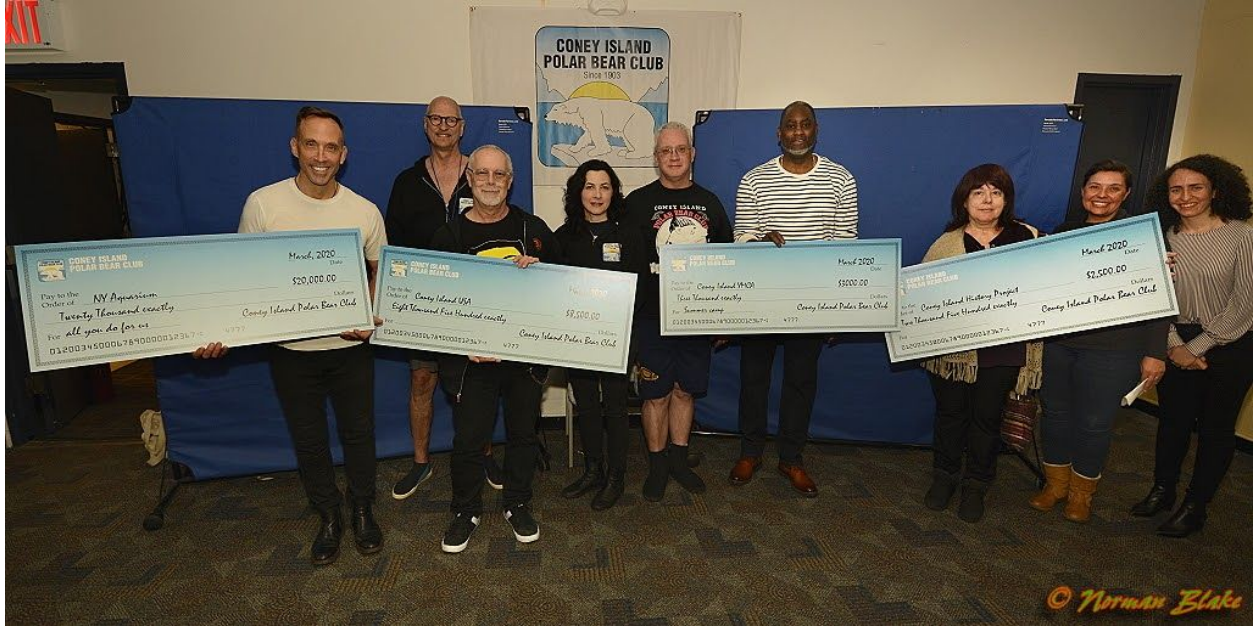
All the awardees.