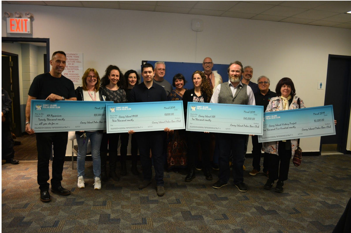
All the awardees.