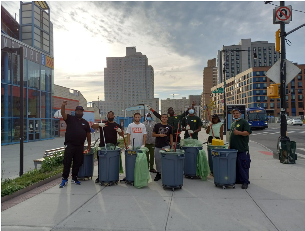
Coney Island Supplemental Sanitation Team, funded by the City Cleanup Corps Program