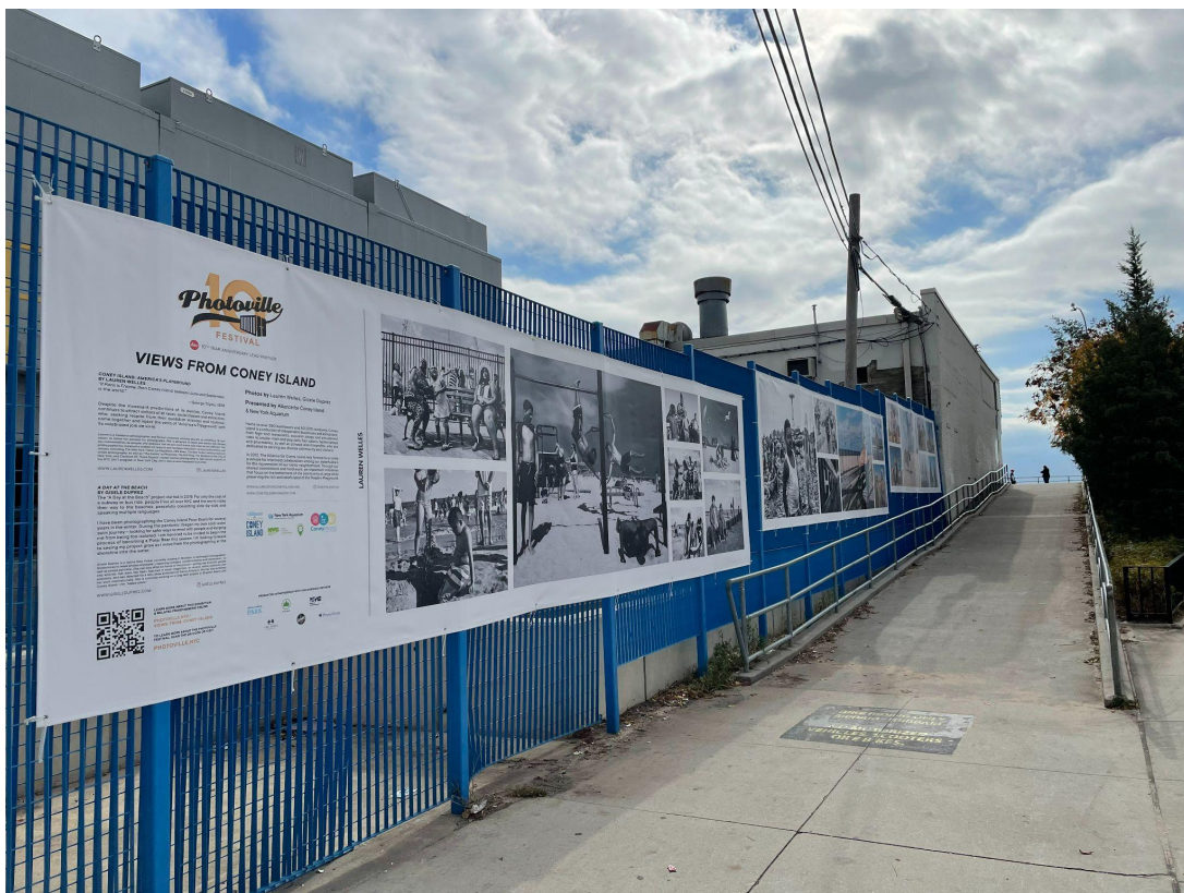
Check out the new Photoville banner, now on view along the NY Aquarium fence, W. 10th Street near the boardwalk entrance, now until Spring 2022.